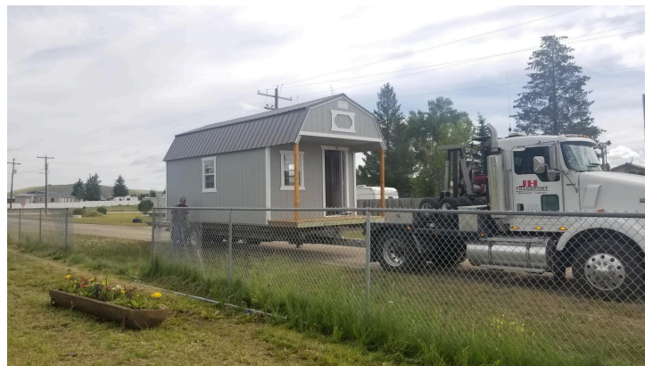
Tetonina library building delivery in 2019.