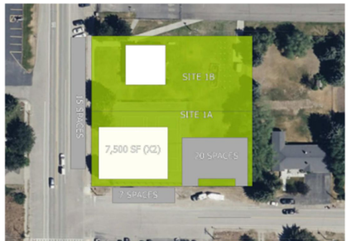
TWO-STORY EXISTING PROPERTY LINES