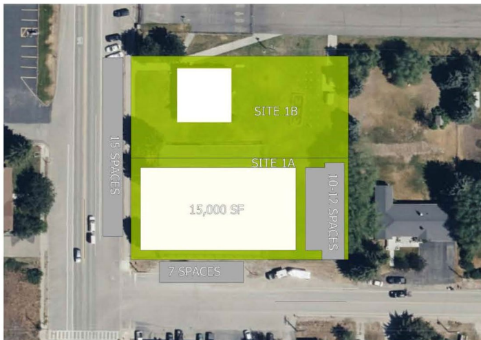
SINGLE STORY EXISTING PROPERTY LINES