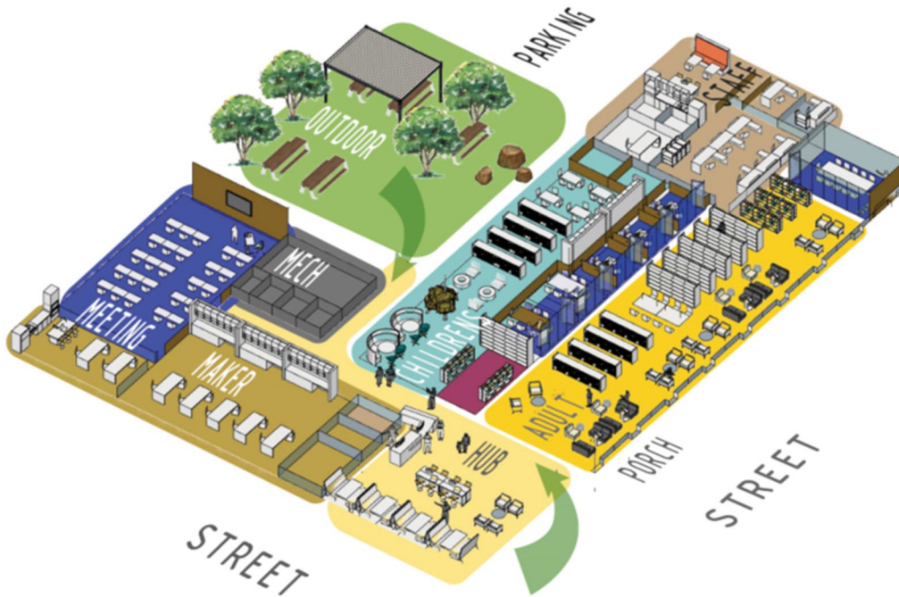
1-STORY BUILDING DIAGRAM