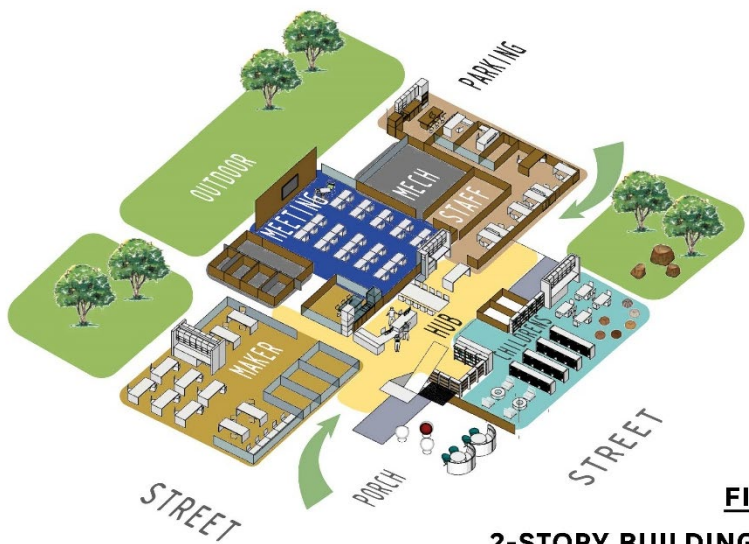
FIRST LEVEL 2-STORY BUILDING DIAGRAM